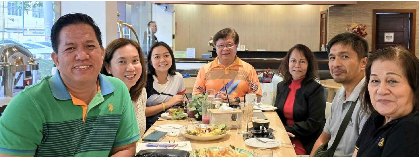
MARCH 3, 2025 | 7 TH BOARD MEETING OF OFFICERS & DIRECTORS AT STAR HOTEL, DAVAO CITY