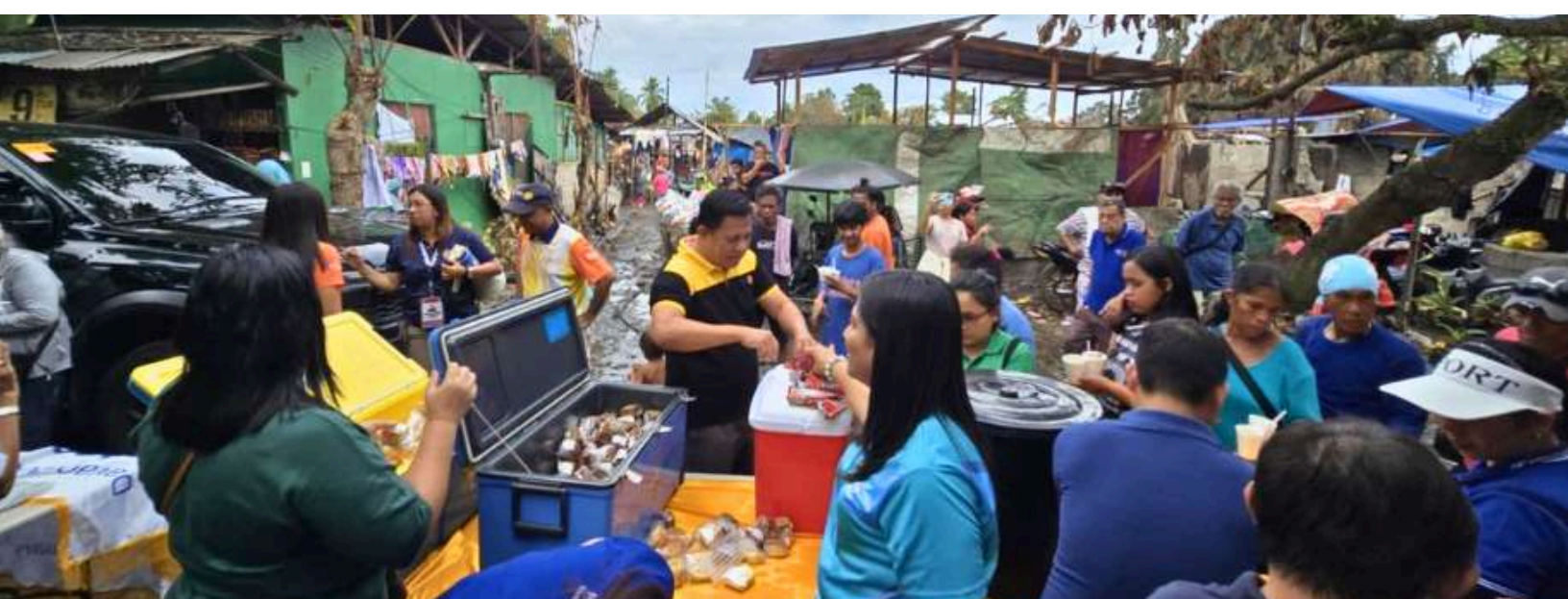
MARCH 11, 2025 | DONATION TO FIRE VICTIMS AT BRGY LIBOGAN, TORIL, DAVAO CITY