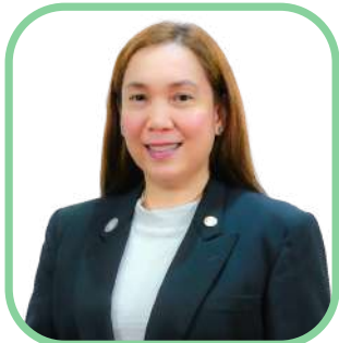
KRIZIA Z. TAN Travel Agency Travel Best Guide