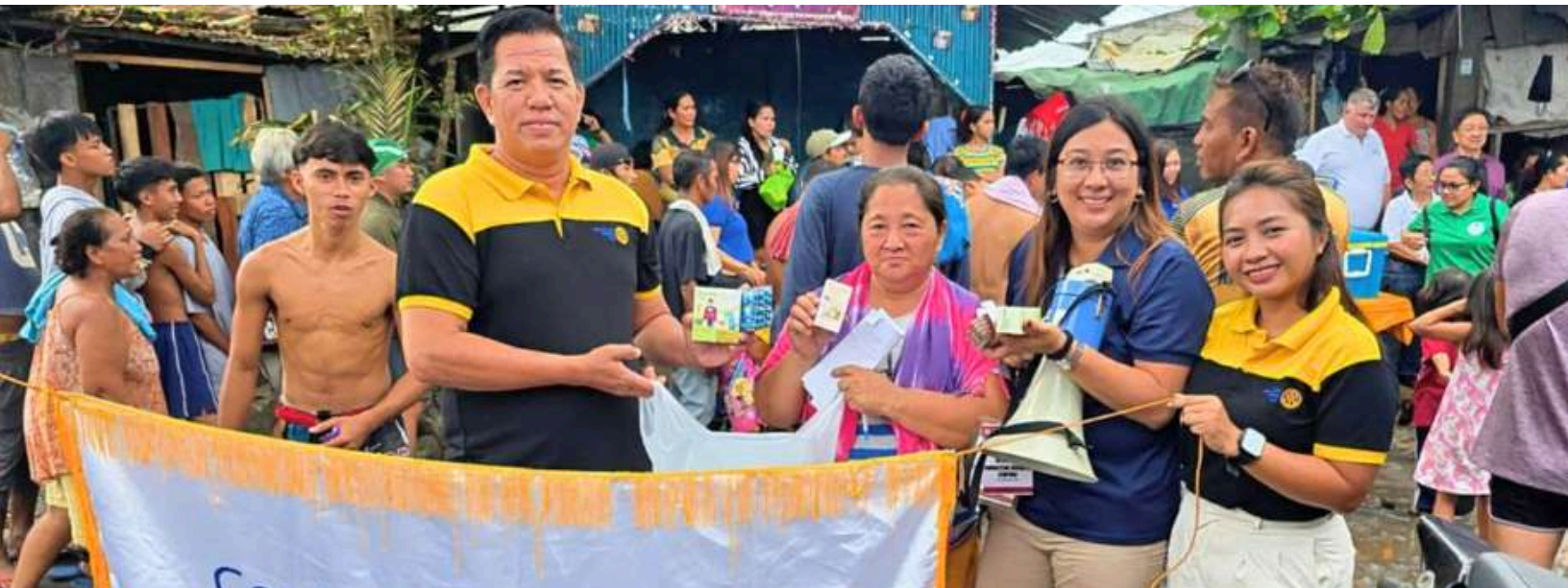
MARCH 11, 2025 | DONATION TO FIRE VICTIMS AT BRGY LIBOGAN, TORIL, DAVAO CITY