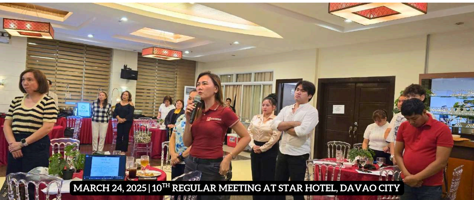
MARCH 24, 2025 | 10 TH REGULAR MEETING AT STAR HOTEL, DAVAO CITY