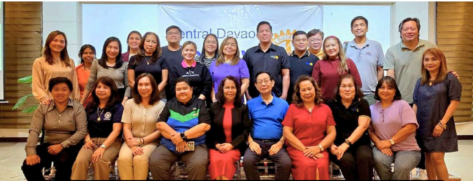
MARCH 3, 2025 | 9 TH REGULAR MEETING & BIRTHDAY CELEB AT STAR HOTEL, DAVAO CITY