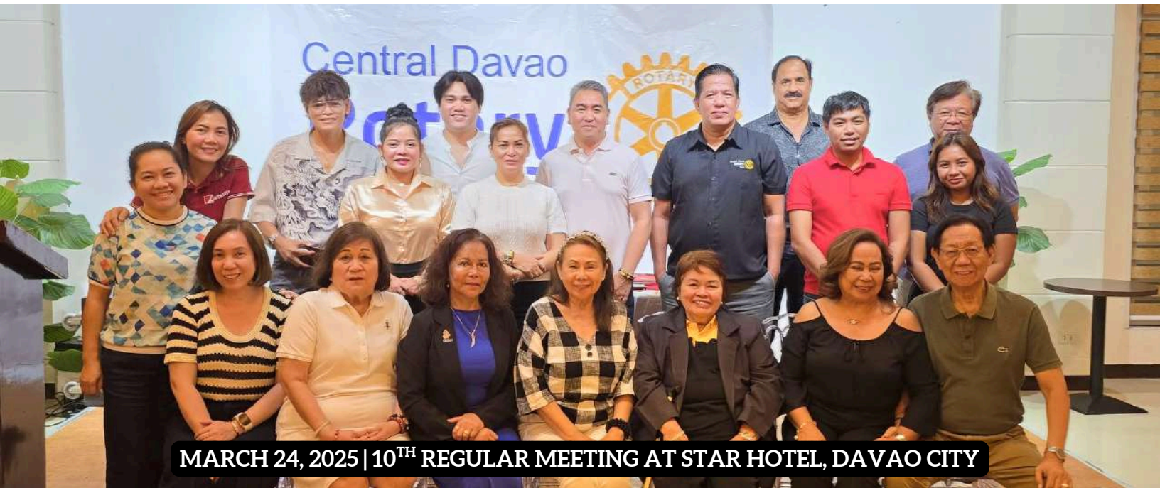
MARCH 24, 2025 | 10 TH REGULAR MEETING AT STAR HOTEL, DAVAO CITY